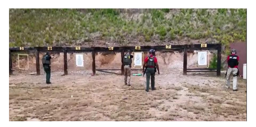
OEE Special Agents training at an outdoor firing range

The Penalty: In November 2018, Sheehan was sentenced to 24 months of probation, a $500 criminal fine, and a $200 special assessment. In September 2019, Mohamadi was sentenced to 24 months in prison, 24 months of supervised release, and a $200 special assessment. In October 2020, Shaneivar was sentenced to a $100,000 criminal fine and the forfeiture of three commercial properties appraised at over $2,000,000. IC Link was sentenced to a $200,000 criminal fine, and Alamdari was sentenced to a $5,000 criminal fine. On March 6, 2023, BIS issued Mohamadi and Shaneivar post-conviction denial orders for a period of 10 years.