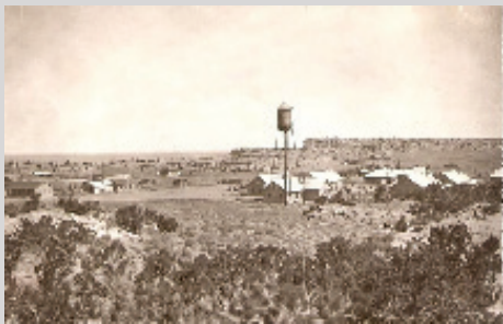
Pueblo Bonito Boarding School in 1917. Classrooms in center with dorms on left and right with overhouse and laundry room on far left.

Cultural capital lends itself to tourism, which plays to the advantage of the K'É Community Trail. Roughly 78% of all leisure travelers in the U.S. participated in cultural heritage activities while traveling. These figures have resulted in about 188.3 million visitors each year, who spend an average of $994 per trip. If the trail could capture a portion of these dollars with trails that depict historical building sites (left), it would attract tourism that could benefit the local community.