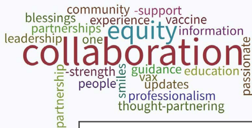
Word Cloud created by attendees of the Annual NMIC meeting responding to "what are the strengths of NMIC?"